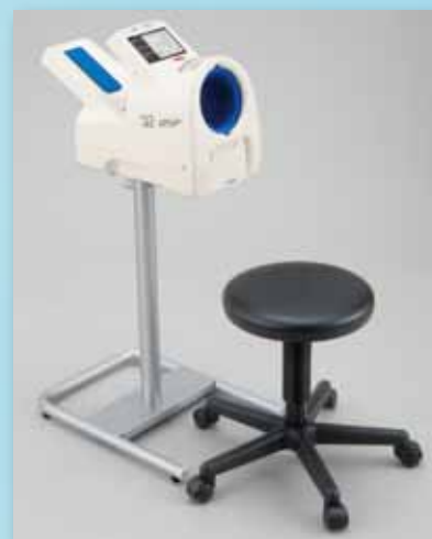
Optional stand & chair